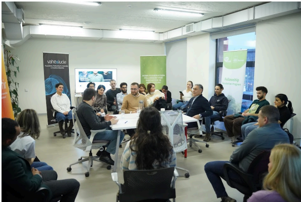
Business Brainstorm Podcast