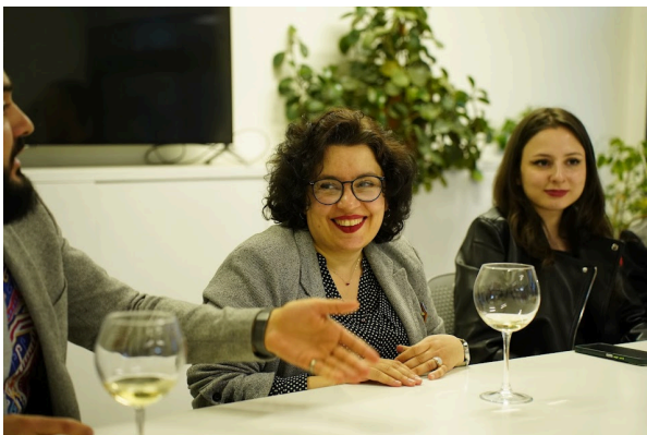
Wine & Cheese Business Evening