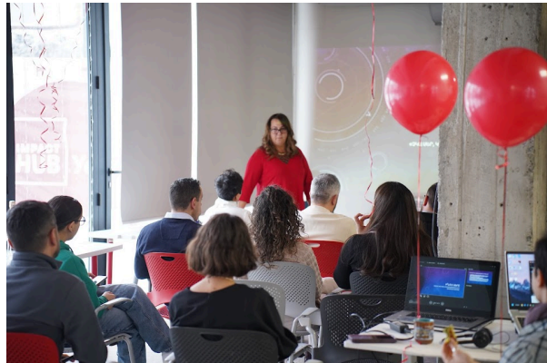
Psychology Talks: On Love